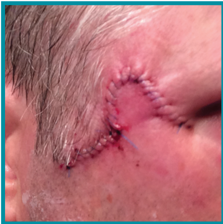
AFTER MOHS SURGERY