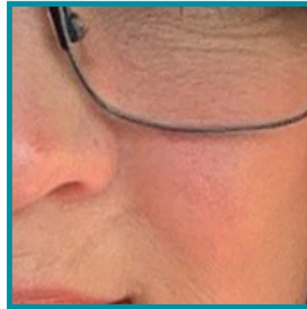
AFTER 90 DAYS USING NEWGEL+UV