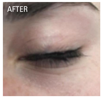
After 5+ months of treatment with NewGel+UV