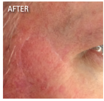
After 3 months of treatment with NewGel+UV